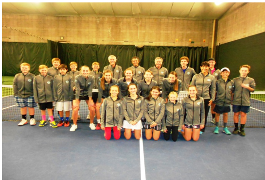
2014-2015 USTA Utah District Competition Training Center