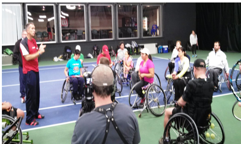
2014 WHEELCHAIR CAMP-SPORTS MALL